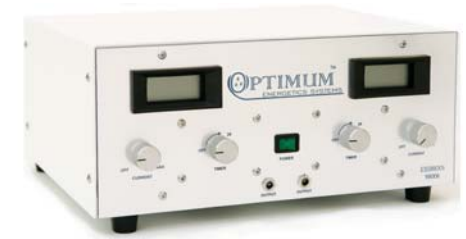
'Perfect for Professionals, 1 or 2 people, (5.5 AMPS/150 watts each side) Works anywhere in the world'