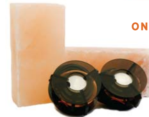
ONLY THE FINEST HIMALAYAN SALT COPPER TUB