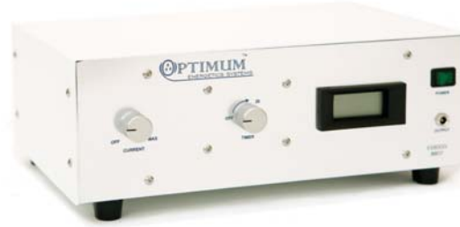
'Perfect for Professionals, double the power (5.5 AMPS/150 watts) Works anywhere in world'