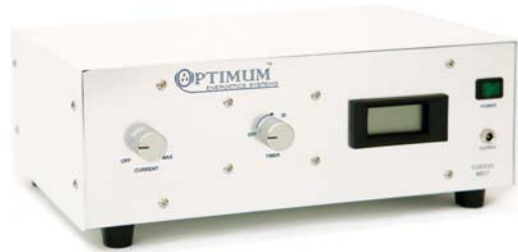
'Perfect for Home (3 AMPS/60 watts), Works anywhere in world'